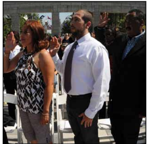
Thirty-three applicants from 24 countries took the oath at Mount Rushmore on August 21, 2008.