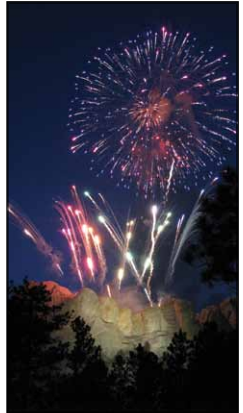
The 2008 fireworks display drew more than 30,000 spectators.